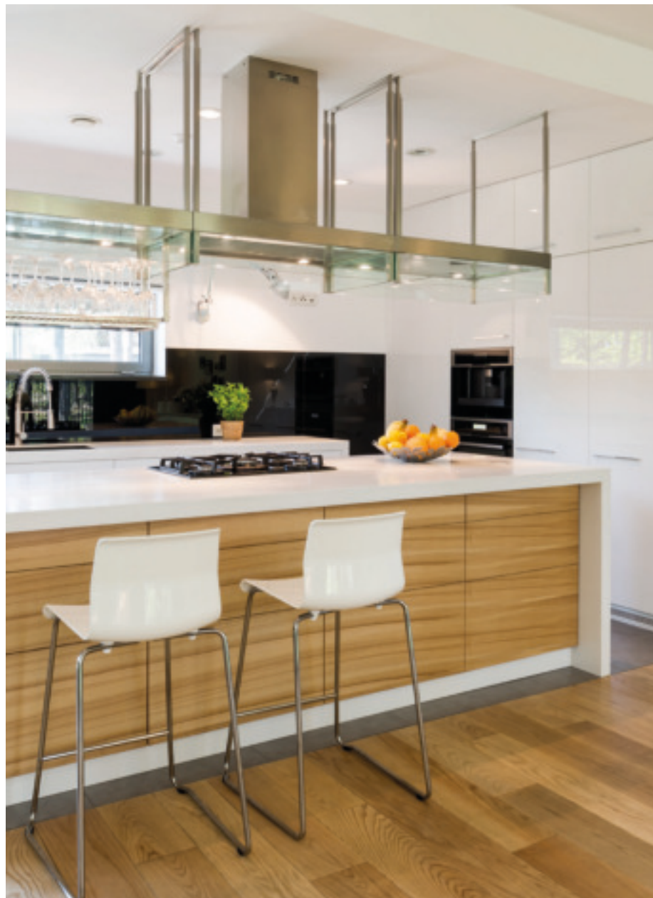
Strong partner – for customised adhesive solutions