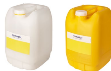
Fold-glues and fold-softening concentrates

Learn more about adhesives and fold-softening concentrates from our brochure „Planatol Fold-Glues“